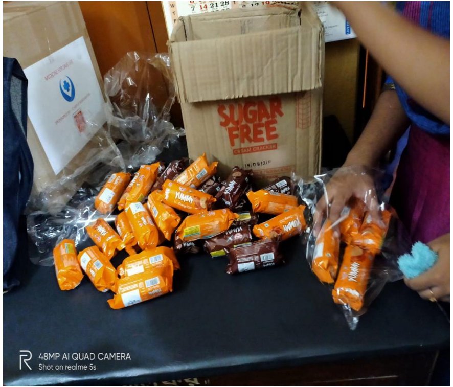
48MP AI QUAD CAMERA Shot on realme 5s