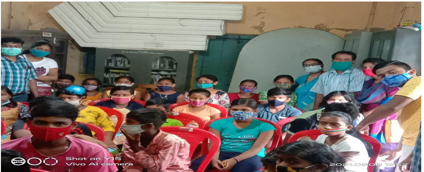
Shot on Y15 Vivo AI camera