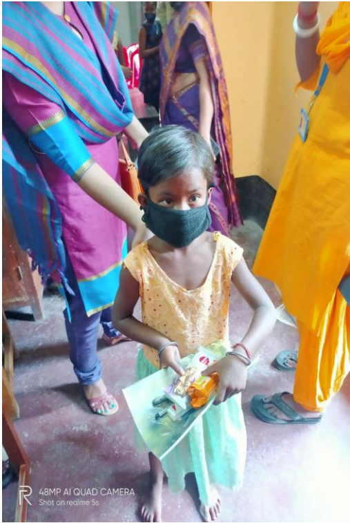
48MP AI QUAD CAMERA Shot on realme 5s