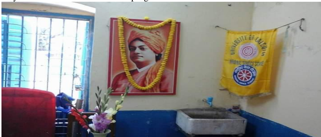
Celebration of “Yuva Divas”.

of National Youth Day, the spirituality and philosophy of Swami Vivekananda and inspired many students who attended in this programmes.