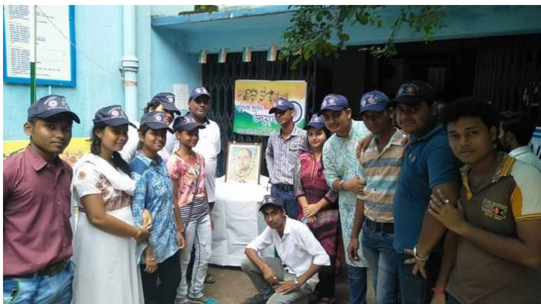
Celebration of ‘Birth day of Netaji Subhas Chandra Bose’.