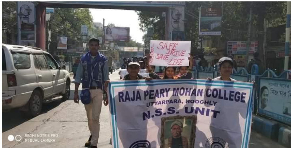
A 'Safe Drive and Save Life' awareness programme.