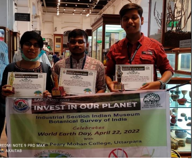
Indian Museum, Kolkata is an institution which is under the Ministry of Culture,

Government of India. It is the largest and oldest museum in India. The history of the origin of the Indian Museum is one of the remarkable events towards the development of heritage and culture in India. It was founded in 1814 under the guidance of Dr. Nathanial Wallich. Interesting and curious objects which were collected from various parts of this country were deposited in this museum. A list of gifts consisted of 174 items which were donated by 27 European were kept here.